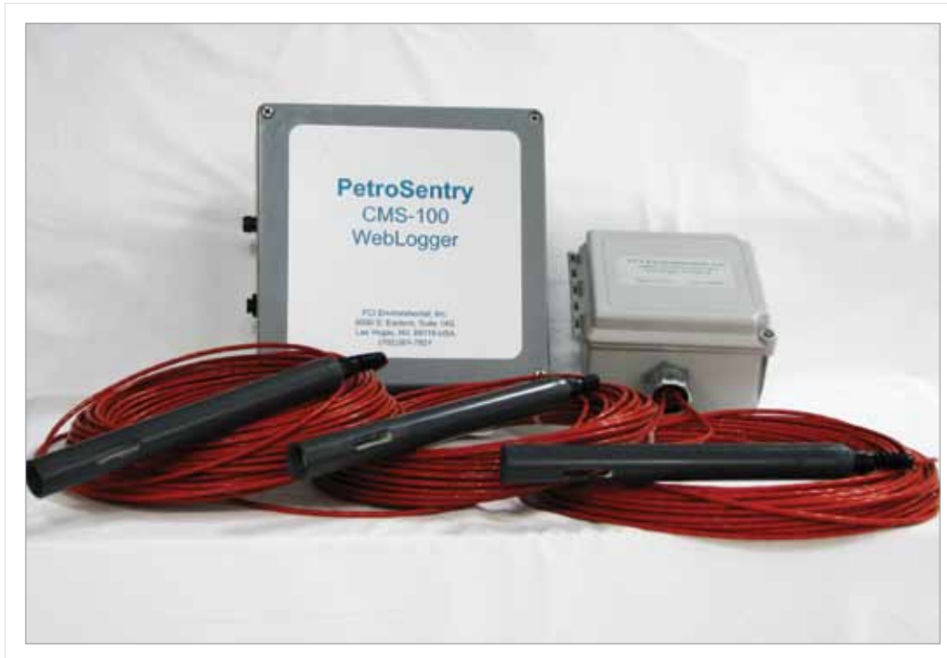
CMS-100 WEB-BASED LOGGER