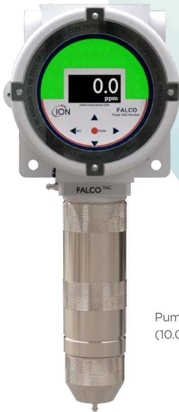
Pumped TAC (10.0eV) model

Offering the ultimate in safety FALCO overcomes false readings found with other PIDs. Its multi-coloured LED status display can be seen from a distance of twenty metres in direct sunlight ensuring you are clearly alerted to hazards present.