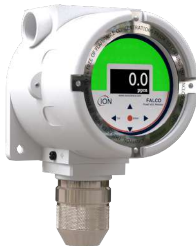
Diffused 10.6eV model

FALCO is the latest generation of fixed photoionisation detectors (PIDs) from ION Science that continuously detect a wide range of volatile organic compounds (VOCs).